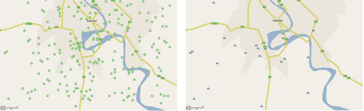
Fig. 4. These screenshots show the original 200 events (left) and the results after filtering the semantically enriched events for vehicle thefts (right). The resulting events are projected as icons onto a map of the AOR for analysts to examine. Selecting an event icon causes the message details and the semantic metadata to be displayed.

These results are very promising and show that Wave-EF can identify vehicle theft events with high precision. In addition, key attributes that greatly enhance discovery of relevant data are also extracted. These attributes include the time, location, perpetrator and stolen object attributes of these events. The extracted attributes can be used as semantic metadata tags associated with the messages and stored in a net-centric metadata catalog or to populate a RDF triple store for reasoning. For example, the JC3IEDM metadata tags generated for USMTF message described in Figure 3 are shown in Figure 5.